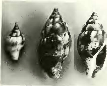
FIG. 1. Immature paratype and holotype (24.4 mm) of Pyrene ( Conella ) ledaluciae Rios and Tostes, new species, from off Marica, Rio de Janeiro State, Brazil.